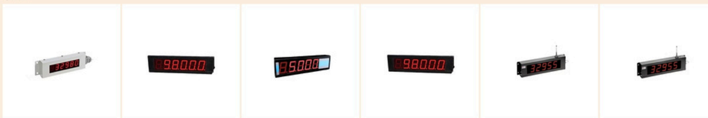
TD06a - TTD 1Inch_6Digit