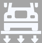
TRUCK SCALE / WEIGHBRIDGES