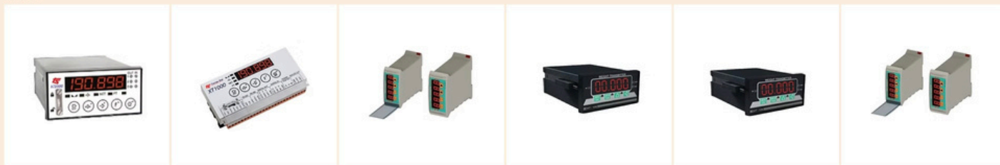
Thames Side XT2000