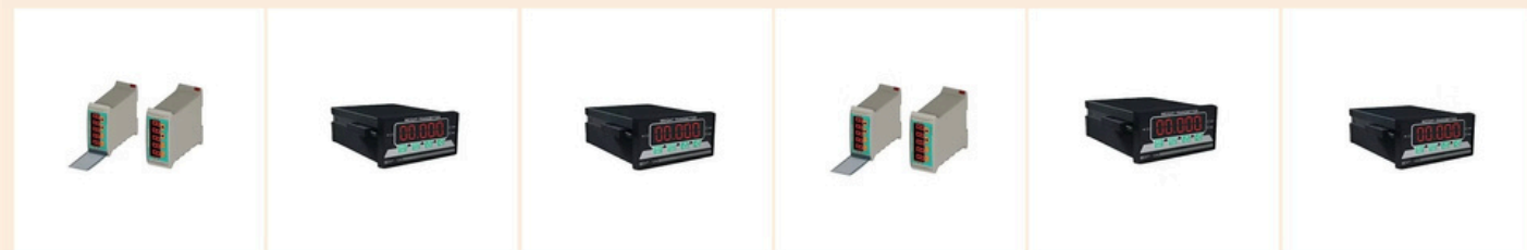
Analog Weight Indicator DIN Rail Mount