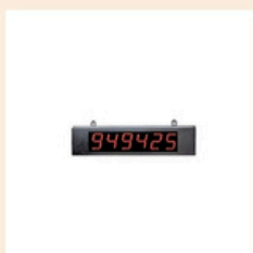
Day Light Visible Serial Display