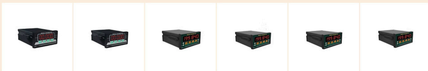
Ethernet Weight Transmitter