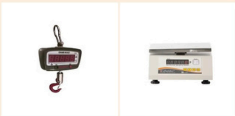
Caliber Crane Scale