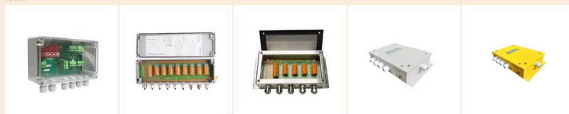
Thames Side Intelligent Junction Box