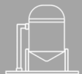
TANK / SILO / HOPPER WEIGHING