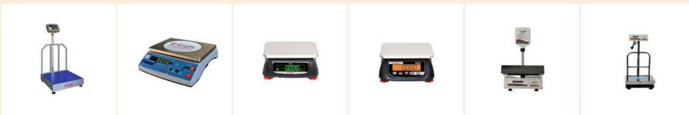
Industrial Platform Weighing scale | EIW Series