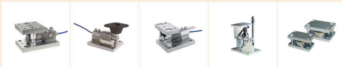
Thames Side LA85 Conventional Mounting Assembly