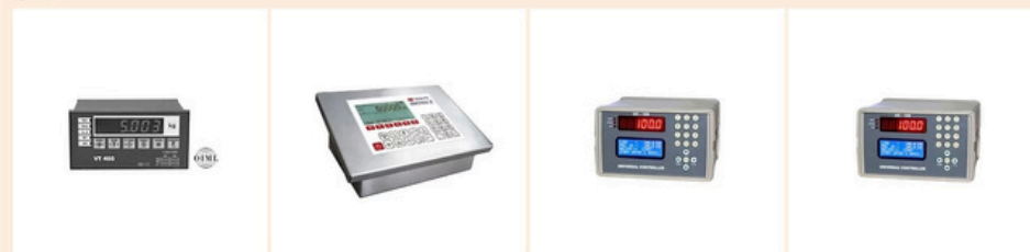
VPG - Revere - VT 400