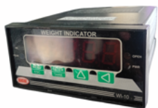
WT 10 D