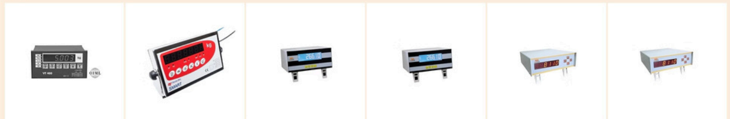
VPG - Revere - VT 400