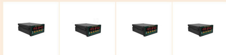
Ethernet Weight Indicator