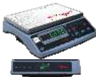
Double display for customer viewing